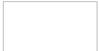
3735-60 Diffuser film