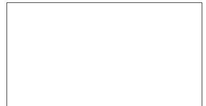
IJ3730-50 Inkjet printable film